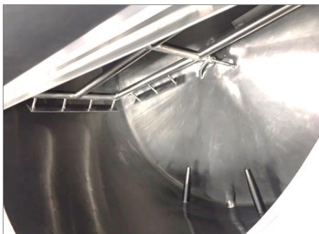
Full Sweep Agitation